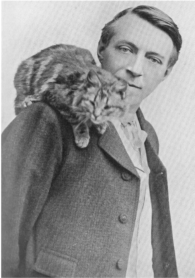
BROWN TABBY—"A FAVOURITE CORNER"

personality, and often understands, in a most weird and startling way, the meaning of what you say to it.