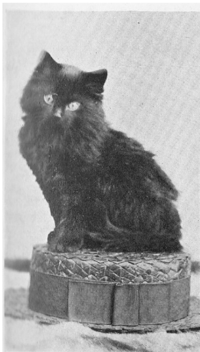
MONARCH OF ALL HE SURVEYS

Let us look at the matter from another point of view altogether. The peculiar effect of the bagpipes is caused by the fact that a monotone A is always sounding, like a pedal note on the organ. The air continually rushes out and causes this monotonous but musical sound below the melody. Then again, when Man sings, the sound is produced by the outrushing of the air; and by the use of muscles which change the shape of the vocal cords, Man can vary the pitch of the note. If moisture gathers in your throat while you are singing, as it does if you are "out of practice", the column of air is broken and the tone ceases. I cannot, therefore, believe that purring is a wet sound it seems to me to be monotone singing. Puss uses only one note, Man uses and combines several; Man can walk about while singing, he can move tongue and jaws in forming words; a Cat can move and can lick its fur or your hand. The similarity is, at least, striking. Now comes the question: Does Puss sing, or merely gargle?