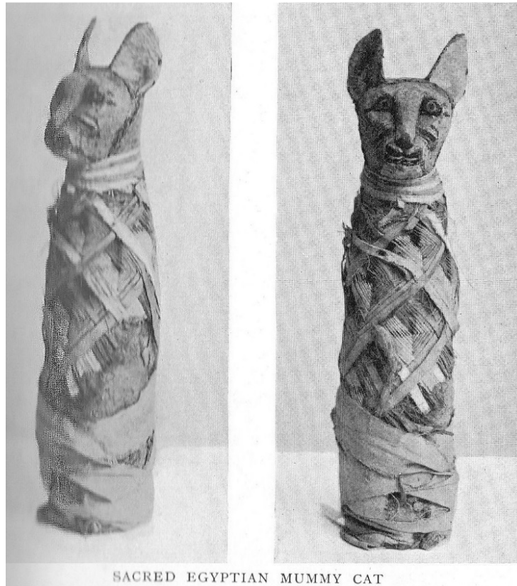
SACRED EGYPTIAN MUMMY CAT

have perfect round eyes, a feature of great beauty in a well-kept pet. One mummy-cat in the British Museum (No. 35858) has an artificial eye - according to the label, "inlaid obsidian eyes" - made from volcanic glass. The colour chosen is a deep orange or copper, as nearly as possible the same as the ideal colour of to-day!