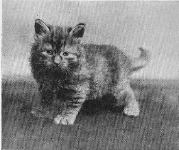
EIGHT WEEKS' OLD